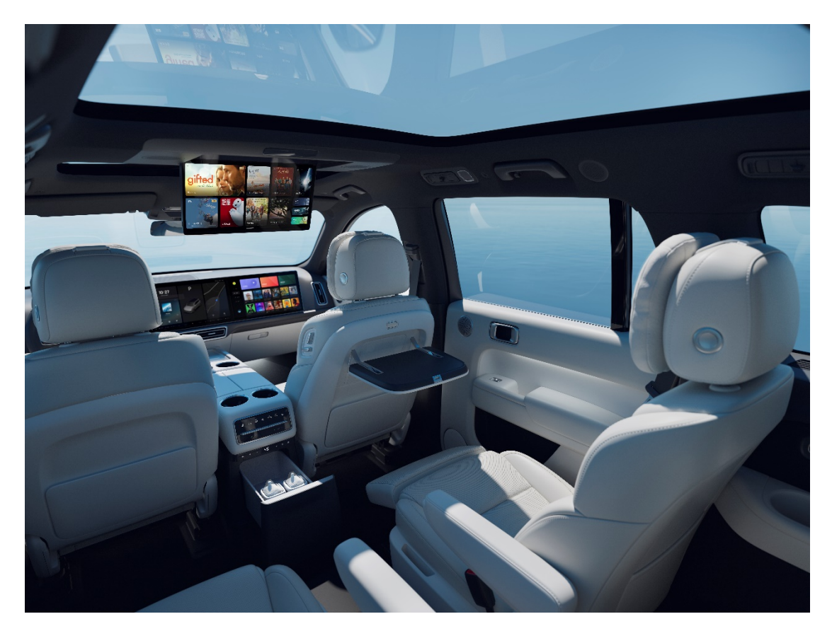
Flagship Space, Comfort and Design

The goal of Li L9 is to create a flagship smart SUV for families. With flagship space and comfort, it aims to make every member of the family feel at home on their journey. In terms of dimensions, Li L9 has a length of 5,218 millimeters, width of 1,998 millimeters, height of 1,800 millimeters, and wheelbase of 3,105 millimeters. Through careful designs of the vehicle layout and space, Li L9's interiors space surpasses that of mainstream SUVs in its class.